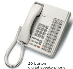
20-button digital speakerphone

The Strata CTX28 even protects your investment should your needs eventually require a larger Toshiba telephone system. Simply upgrade and take your telephones with you. Virtually all telephones integrate easily with your new equipment.