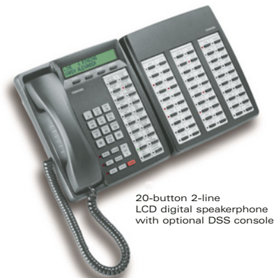
20-button 2-line LCD digital speakerphone with optional DSS console