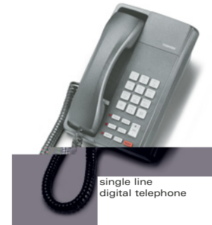
single line digital telephone