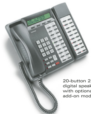
20-button 2-line LCD digital speakerphone with optional add-on module